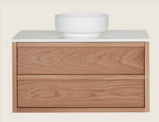
Pictured: Angourie Single Vanity, American Oak Light, Quantum Quartz Alpine White Stone Top